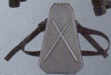
Back Pack for Sniper Rifle