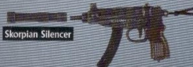
Czechoslovakian-made Skorpion Machine-Pistol