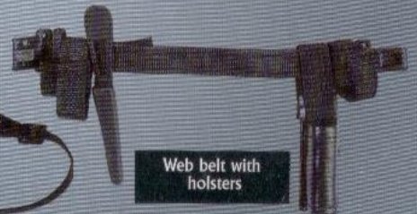
Web belt with holsters