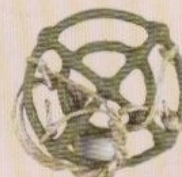
NVA Camo Ring