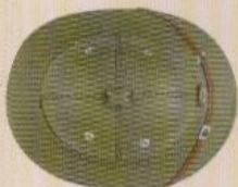
NVA Plt Helmet