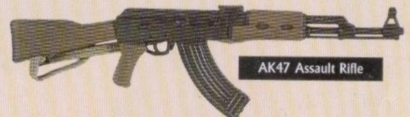
AK47 Assault Rifle