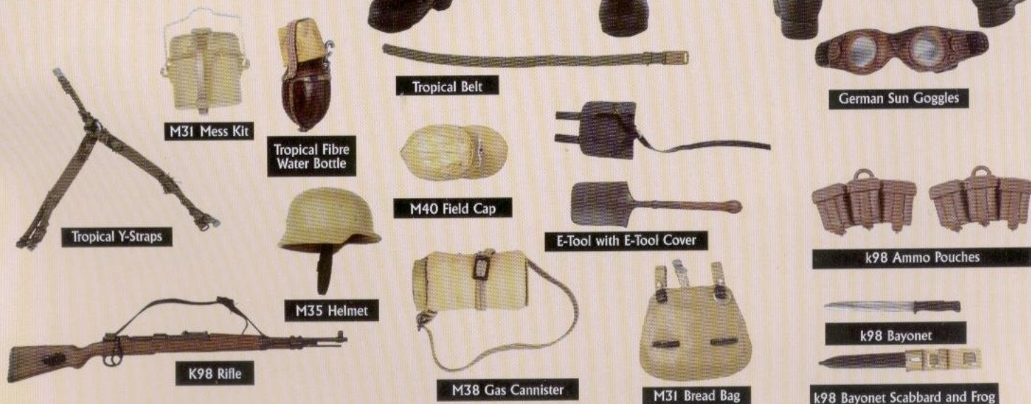
M31 Mess Kit

The Ultimate Soldier is a registered trademark of 21st Century Toys. All rights reserved. Used with permission.